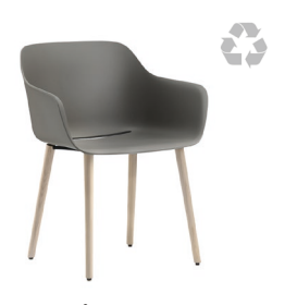
Babila XL 2754