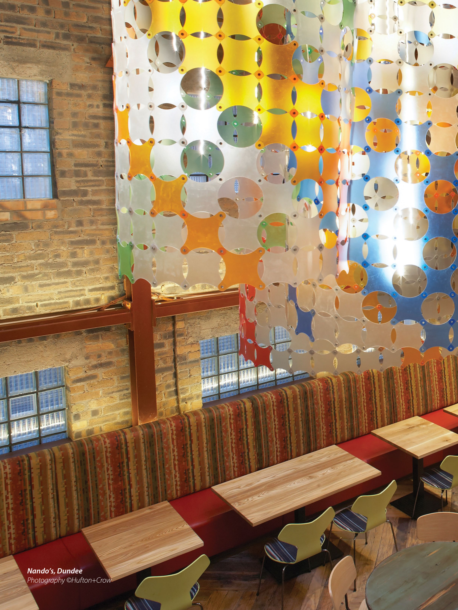
Nando's, Dundee