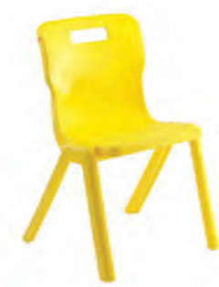
T4AN - SIZE 4 AGES 8 - 9

Overall dimensions: D408 W432 H690 Seat dimensions: D331 W340 H380 Weight capacity: 107kg