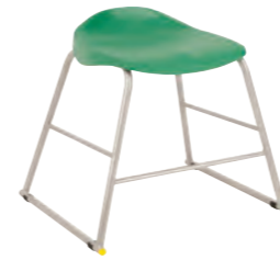
T90 - SIZE 3 AGES 5 - 7

Unique frame design protects all laboratory flooring