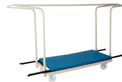
T10-T - EXAM DESK TROLLEY

Overall dimensions: D1267 W600 H473 Desk capacity: 40 exam desks