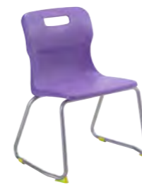
T23 - SIZE 3 AGES 5 - 7

Overall dimensions: D368 W507 H660 Seat dimensions: D320 W387 H350 Weight capacity: 95kg