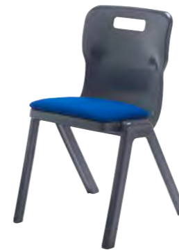
T8 - FABRIC SEAT PAD

Overall dimensions: D345 W365 Upholstered in Bradbury Pyra fabric Minimum order quantity of 5