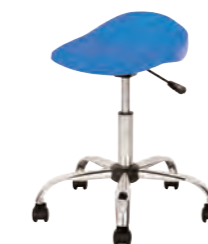
T33 - SENIOR SWIVEL STOOL AGES 11+

Overall dimensions: D600 W600 H505 - 605 Seat dimensions: D414 W420 H465 - 555 Base diameter: 600 Weight capacity: 97kg