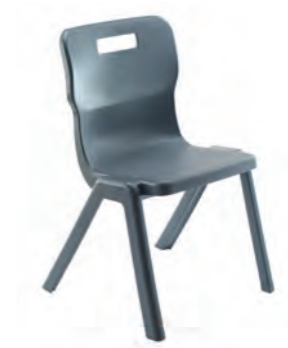
T6 - SIZE 6 AGES 13+

Overall dimensions: D510 W482 H829 Seat dimensions: D414 W370 H460 Weight capacity: 158kg