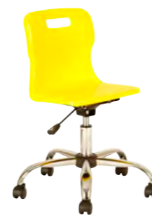
T30 - JUNIOR SWIVEL CHAIR AGES 5 - 11

Overall dimensions: D600 W600 H765 - 820 Seat dimensions: D320 W387 H365 - 435 Base diameter: 600 Weight capacity: 97kg