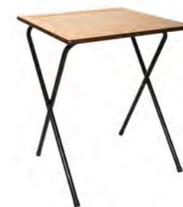
TC66ED-PREM-720 - EXAM DESK MDF

Graffiti proof wipe clean injection moulded polypropylene top with pen groove in Blue or Charcoal with ultra-strong 22mm diameter Black EPC folding frame