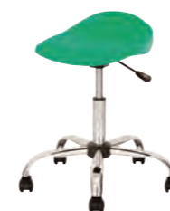
T32 - JUNIOR SWIVEL STOOL AGES 5 - 11

Overall dimensions: D600 W600 H445 - 500 Seat dimensions: D390 W420 H405 - 475 Base diameter: 600 Weight capacity: 97kg