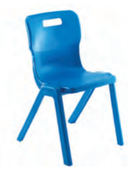
T5 - SIZE 5 AGES 9 - 13

Overall dimensions: D486 W480 H799 Seat dimensions: D414 W370 H430 Weight capacity: 115kg