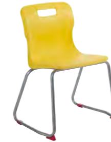
T24 - SIZE 4 AGES 7 - 9

Overall dimensions: D386 W507 H700 Seat dimensions: D320 W387 H380 Weight capacity: 95kg