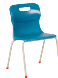
T14 - SIZE 4 AGES 8 - 9

Overall dimensions: D416 W438 H700 Seat dimensions: D320 W387 H380 Weight capacity: 95kg