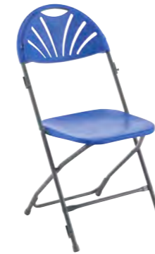
TCFACLK-B - FOLDING CHAIR

Overall dimensions: D515 W460 H870 Seat dimensions: D395 W395 H440 Weight capacity: 100kg