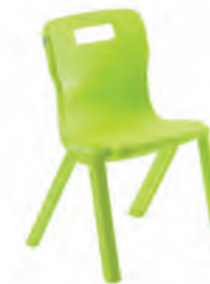
T1AN - SIZE 1 AGES 1 - 2

Overall dimensions: D320 W360 H513 Seat dimensions: D279 W275 H260 Weight capacity: 97kg