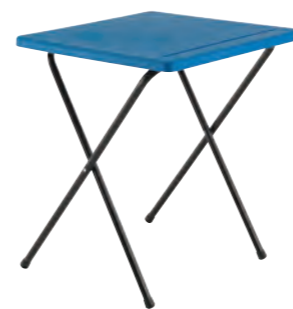
T10 - EXAM DESK

Graffiti proof tops with integral pen groove