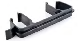
T7 LINKING CLIP

Overall dimensions: D480 W650 H1158 Capacity: 15 Chairs