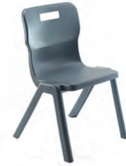
T6AN - SIZE 6 AGES 13+

Overall dimensions: D510 W482 H829 Seat dimensions: D414 W370 H460 Weight capacity: 158kg