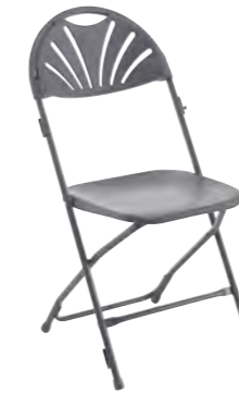
TCFACLK-C - FOLDING CHAIR

Overall dimensions: D515 W460 H870 Seat dimensions: D395 W395 H440 Weight capacity: 100kg