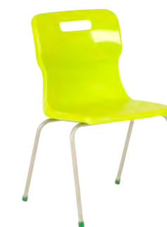
T15 - SIZE 5 AGES 9 - 13

Overall dimensions: D477 W497 H790 Seat dimensions: D406 W423 H430 Weight capacity: 140kg