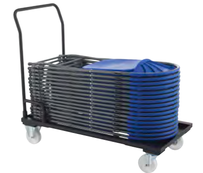
TC40T - FOLDING CHAIR TROLLEY

Overall dimensions: D1267 W600 H473 Desk capacity: 40 exam desks