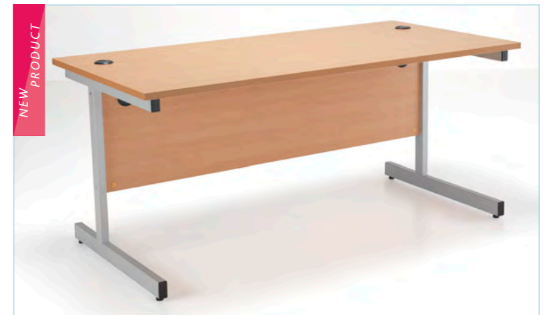
TEACHERS DESK Page 44 - 45