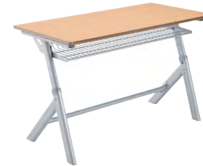
T55 - RECTANGULAR

Overall dimensions: D600 W1200 H530 - 760