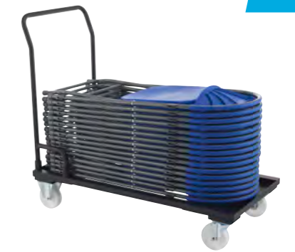
TC40T - FOLDING CHAIR TROLLEY

Overall dimensions: D540 W1120 H1000 Weight capacity: 80kg