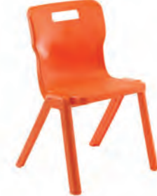
T3AN - SIZE 3 AGES 5 - 7

Overall dimensions: D384 W430 H600 Seat dimensions: D331 W340 H350 Weight capacity: 107kg