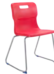
T26 - SIZE 6 AGES 13+

Overall dimensions: D477 W540 H836 Seat dimensions: D406 W423 H460 Weight capacity: 140kg