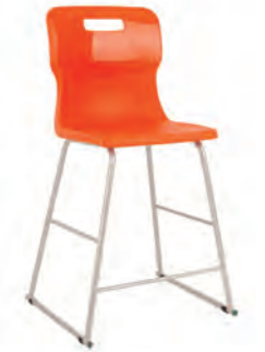
T62 - SIZE 5 AGES 9 - 13

Overall dimensions: D530 W550 H970 Seat dimensions: D406 W423 H610 Weight capacity: 140kg