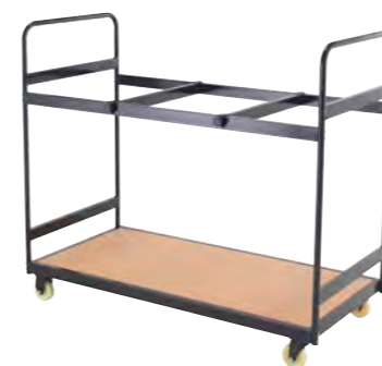
TCEDT-UNI - EXAM DESK TROLLEY

Overall dimensions: D1225 W660 H1150 Desk capacity: 25 exam desks