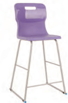
T63 - SIZE 6 AGES 13+

Overall dimensions: D530 W550 H1020 Seat dimensions: D406 W423 H685 Weight capacity: 140kg