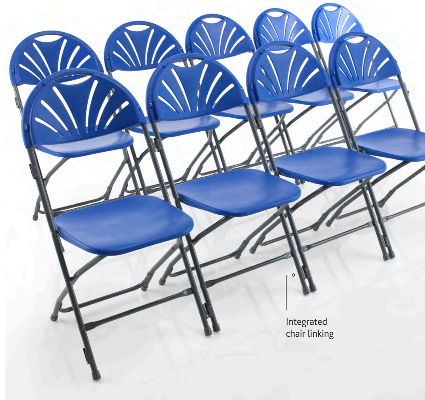
Integrated chair linking

The Folding Chair combines double riveted construction and heavy duty feet to provide strength and stability. The seat and back are ergonomically moulded for user comfort and the back also has a breathable fan design. Available in blue or charcoal, the Titan Folding Chair can be perfectly paired with the Titan Exam Desks.