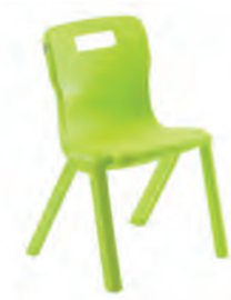
T1 - SIZE 1 AGES 1 - 2

Overall dimensions: D320 W360 H513 Seat dimensions: D279 W275 H260 Weight capacity: 97kg