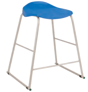
T92 - SIZE 5 AGES 9 - 13

Overall dimensions: D530 W550 H600 Seat dimensions: D361 W365 H560 Weight capacity: 97kg