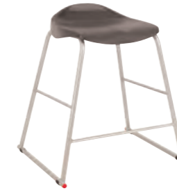
T91 - SIZE 4 AGES 7 - 9

Overall dimensions: D530 W550 H495 Seat dimensions: D361 W365 H445 Weight capacity: 97kg