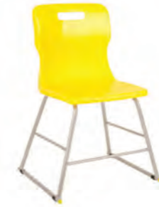
T60 - SIZE 3 AGES 5 - 7

Unique frame design protects all laboratory flooring