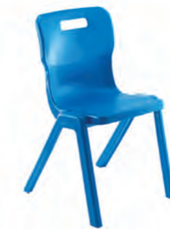
T5AN - SIZE 5 AGES 9 - 13

Overall dimensions: D486 W480 H799 Seat dimensions: D414 W370 H430 Weight capacity: 115kg