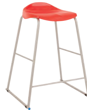
T93 - SIZE 6 AGES 13+

Overall dimensions: D530 W550 H725 Seat dimensions: D361 W365 H685 Weight capacity: 107kg