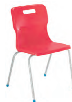
T16 - SIZE 6 AGES 13+

Overall dimensions: D495 W497 H820 Seat dimensions: D406 W423 H460 Weight capacity: 140kg