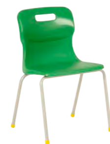
T13 - SIZE 3 AGES 5 - 7

Overall dimensions: D398 W438 H670 Seat dimensions: D320 W387 H350 Weight capacity: 95kg