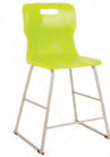
T61 - SIZE 4 AGES 7 - 9

Overall dimensions: D530 W550 H920 Seat dimensions: D406 W423 H560 Weight capacity: 95kg