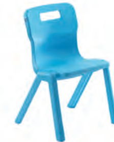
T2AN - SIZE 2 AGES 3 - 4

Overall dimensions: D343 W363 H563 Seat dimensions: D279 W275 H310 Weight capacity: 97kg