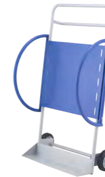
T40 - TROLLEY

Overall dimensions: D345 W365 Upholstered in Bradbury Pyra fabric Minimum order quantity of 5