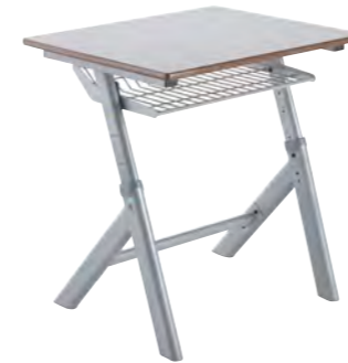
T50 - SQUARE

Overall dimensions: D600 W700 H530 - 760