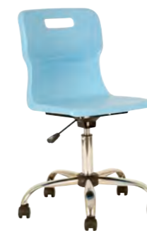
T35 - SENIOR SWIVEL CHAIR AGES 11+

Overall dimensions: D600 W600 H845 - 930 Seat dimensions: D406 W423 H435 - 525 Base diameter: 600 Weight capacity: 107kg