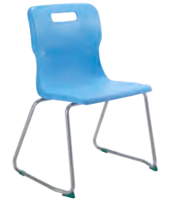
T25 - SIZE 5 AGES 9 - 13

Overall dimensions: D456 W540 H806 Seat dimensions: D406 W423 H430 Weight capacity: 140kg