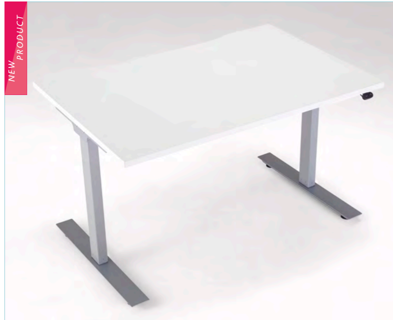
HEIGHT ADJUSTABLE DESK Page 44 - 45